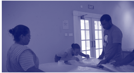
Wrapping prints and paintings in the Cunard Gallery

On July 16 and 17 the BMHS conducted its annual disaster preparedness exercises. Shutters were installed to protect windows and doors. The Cunard Gallery was the major focus this year - there was an assessment of the length of time that was needed to carefully and securely pack the prints, paintings and objects and to re-install them. A walk-through was done of the other galleries and offices to remind everyone of what needs to be done in the event of a disaster and to assess whether any additional materials and procedures were needed.