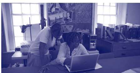
Workshop participants using the resources of the Shilstone Memorial Library

Look out for the launch of the BMHS/BDA Genealogy Group in November 2012.