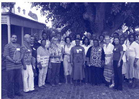
The participants and facilitators of the workshop.