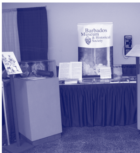
The BMHS booth

The BMHS was commended by many delegates and fellow exhibitors for having a presence outside of its walls and both locals and members of the diaspora expressed a keen interest in visiting the Museum and in the Shilstone Memorial Library's genealogical resources.